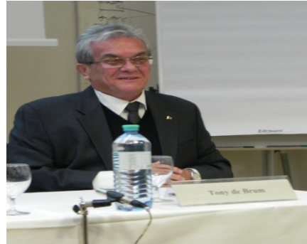
Tony de Brum. Vienna, 5<sup>th</sup> of Dec. 2015.

In Vienna, the foreign minister of the Marshall Islands, Tony de Brum, spoke about the atmosphere of the US military presence as disrupting the Islanders' identity, causing_ruling agony and dislocating communities. The people from Rongelap, for instance, cannot return even today, due to contamination caused by nuclear fall-out. The Northern Marshallese islands were subjected to routine bombings: 67 tests, i.e. "1.7 Hiroshima shots every day for 12 years" (de Brum).