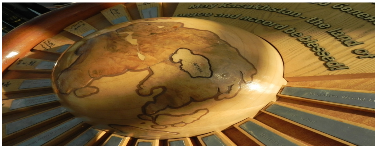
“May Kazakhstan – the land of peace and accord be blessed”. Astana, Baiterek. Oct. 2011.

A convincing symbol of religious dialogue and multinational accord, is the Baiterek tower, the ‘Tree of life’, in the heart of Astana, the new capital of Kazakhstan. In the ‘golden egg’, at the top of the monument, Kazakhstan is depicted as the epicenter of peace, inviting people of different faiths to work creatively for coexistence and a world without wars.