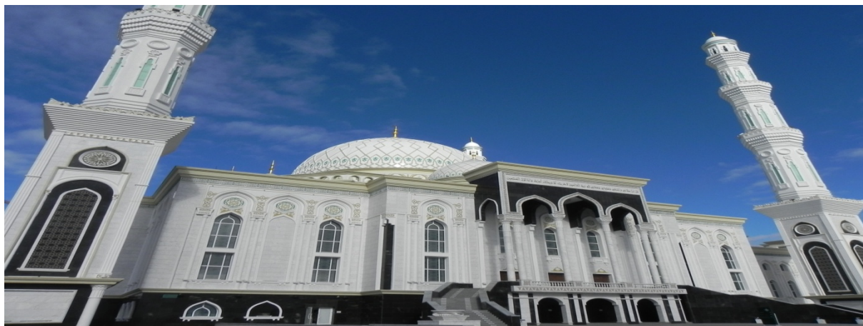
Hazrat Sultan Mosque in Astana. Oct. 2013.

Without any interrogation, I reached the shelves to put my shoes on, and with calm curiosity I entered the bathing section where women were washing their faces and feet. Over impressive floors, I ascended to the main hall and simply sat down on the comfortable ground in the women's section. The architecture is stunning and the art overwhelming. While listening to the murmur of voices in prayer around me, my thoughts wander to the Muslim who made me familiar with Kazakh life.