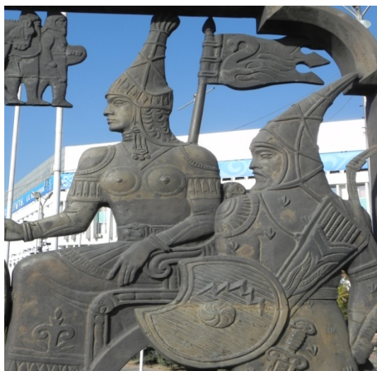
Relief showing Kazakh history. Almaty, Republic Square. Oct. 2013.

Many religions and beliefs are present in multi-ethnic Kazakhstan. Uniting more than 120 ethnicities is a challenging undertaking for the young state, which gained independence in 1991, with the break-up of the USSR. The religious affiliations are approximately: 70 % Muslims, 26 % Christians (Russian Orthodox 24 %, others 2.3 %), Buddhists 0.1 %, others 0.2 %, atheists 2.8 %; remainder unspecified (2009 Census). 1