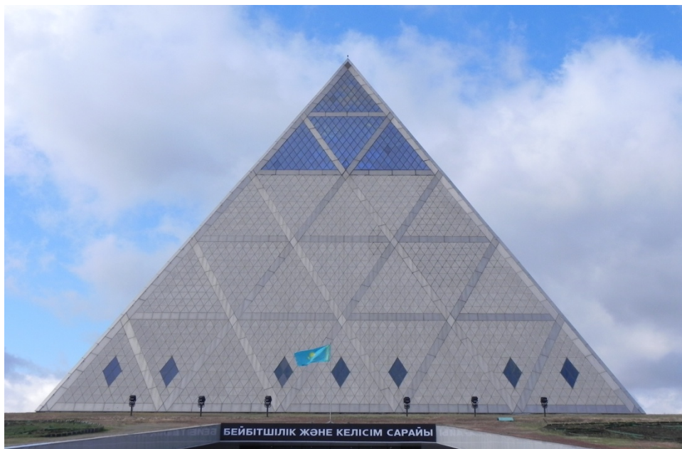
Palace of Peace and Reconciliation. Astana/Kazakhstan. October 2013.

“Human beings have only three virtues: the burning heart, the bright mind – and creative will. Abai Kunanbaev. Kazakh poet (1845-1904), Book of Words (47).