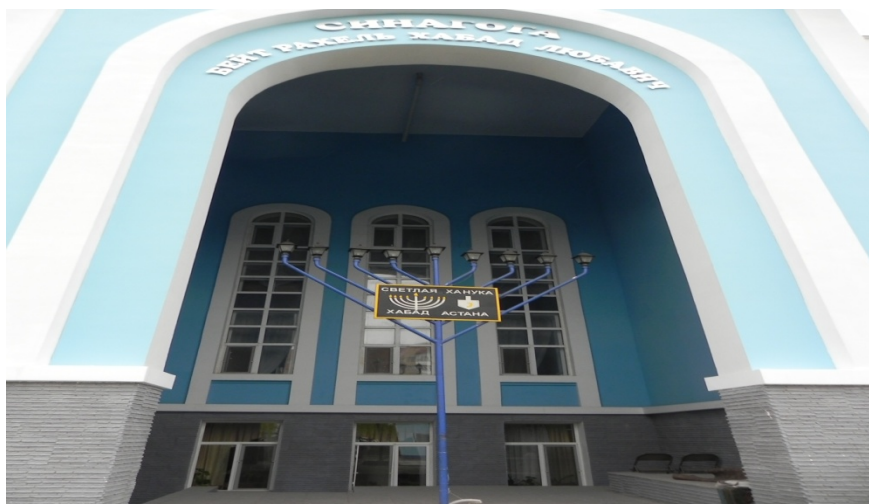
Beit Rahel Synagogue, Astana. Oct. 2013.

Businessman Alexander Mashkevich named the synagogue, opened in 2004, in honor of his mother. The Jewish temple serves about 150 families originally from Belorussia, the Ukraine and Lithuania. 8