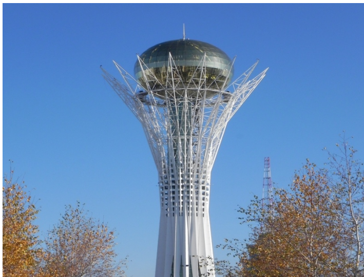
Baiterek. Astana. Oct. 2011.

prior to the Communist revolution. [...] The Kazakhs' biggest complaint, though, was the systematic destruction of their nomadic life.” 3