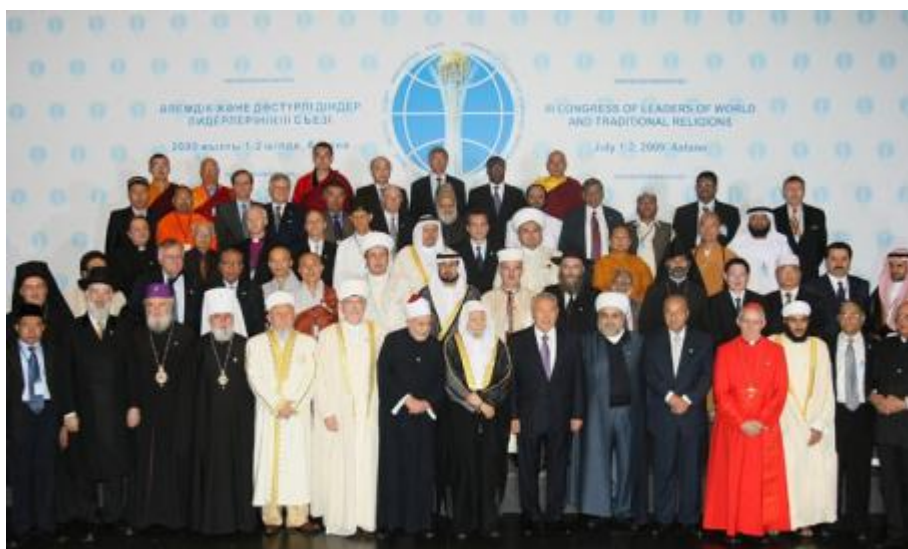
Congress of Leaders of World and Traditional Religions. Astana, 2009. - Photo at the Palace Wall.

How can a global society create sustainable concepts without bringing the knowledge and needs of 50 % of the world population into international fora? Where are the women during those important conferences?