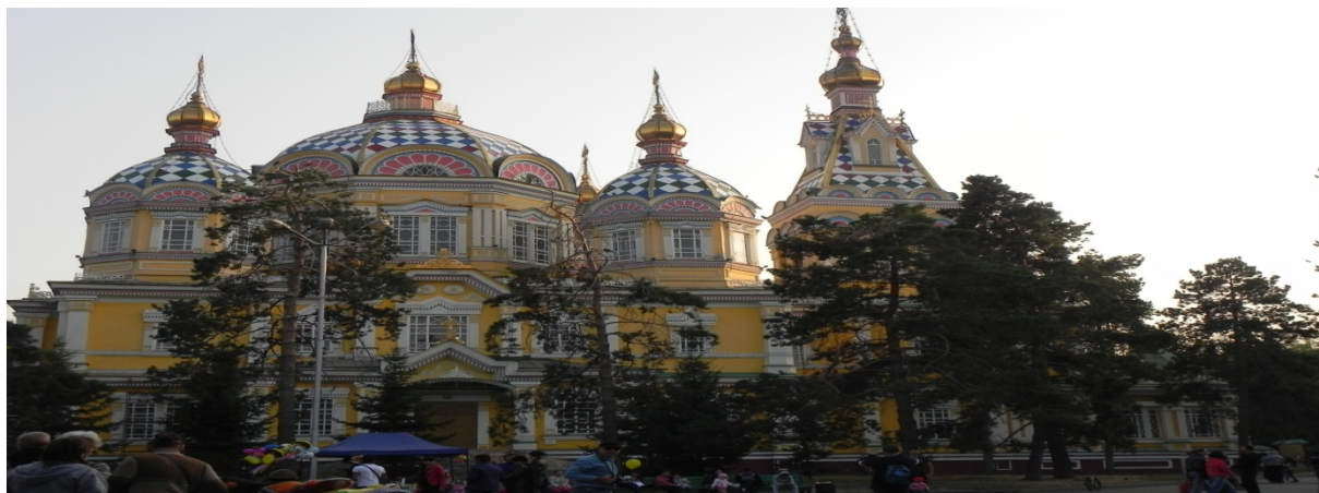
Zenkov Cathedral (Ascension Cathedral), Almaty. October 2013.